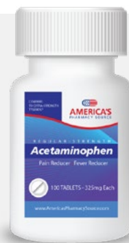
Acetaminophen (Tylenol®) 500mg / 100 Count

Through our relationships and buying power, we can supply you with over-the-counter medications like Fexofenadine, Ibuprofen, Acetaminophen and others at a fraction of the cost. Save money on the medications you use everyday and have them delivered right to your door!