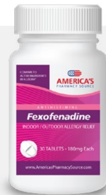
Fexofenadine (Allegra®) 180mg / 30 Count